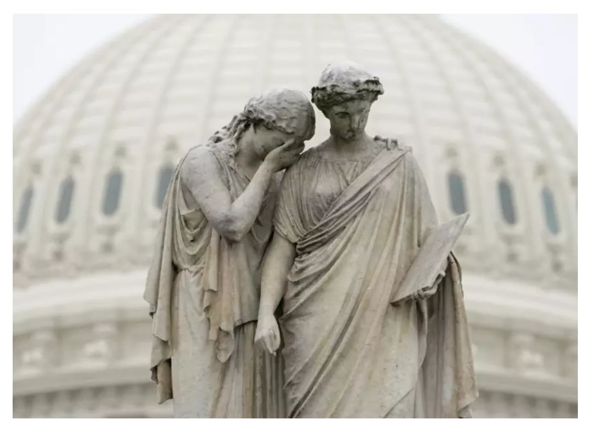
The Peace Monument in front of the U.S. Capitol in Washington

A mental illness crisis is looming as millions of people worldwide are surrounded by death and disease and forced into isolation, poverty and anxiety by the pandemic of COVID-19, United Nations health experts say.